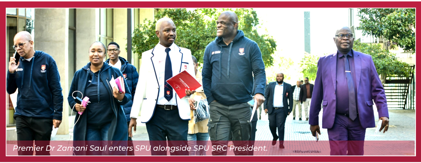
Premier Dr Zamani Saul enters SPU alongside SPU SRC President.