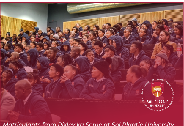
Matriculants from Pixley ka Seme at Sol Plaatje University.