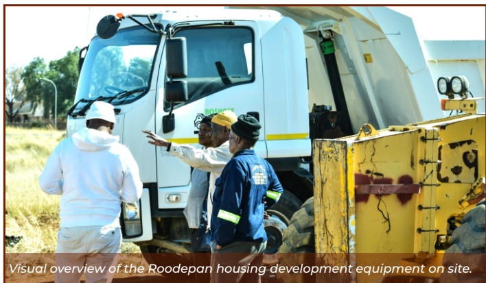
Visual overview of the Roodepan housing development equipment on site.