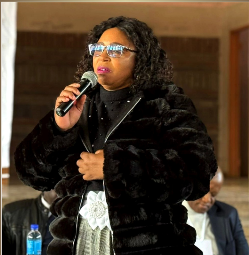
MEC Koloi addressing attendees