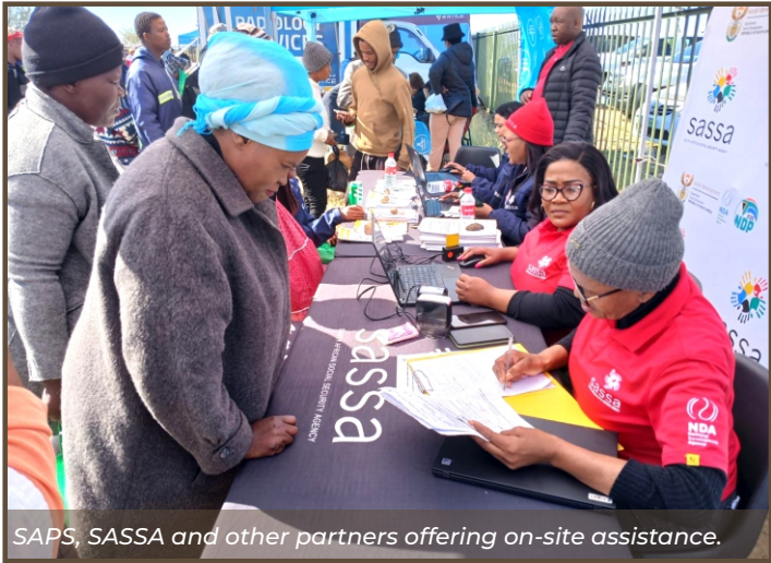
SAPS, SASSA and other partners offering on-site assistance.