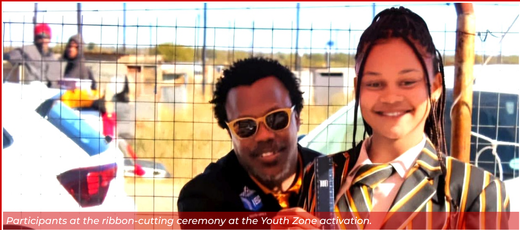
Participants at the ribbon-cutting ceremony at the Youth Zone activation.

This past Friday we marked a significant milestone in activating the Youth Zone Service at Delportshoop Clinic, Dikgatlong Sub District! An initiative of compassion in creating a safe and welcoming environment for young people to access essential services.