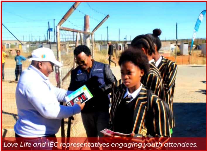
Love Life and IEC representatives engaging youth attendees.