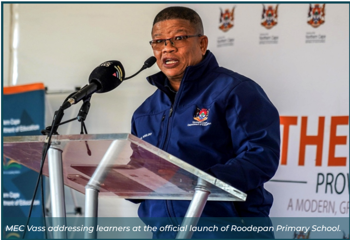
MEC Vass addressing learners at the official launch of Roodepan Primary School.