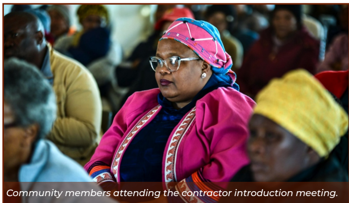
Community members attending the contractor introduction meeting.