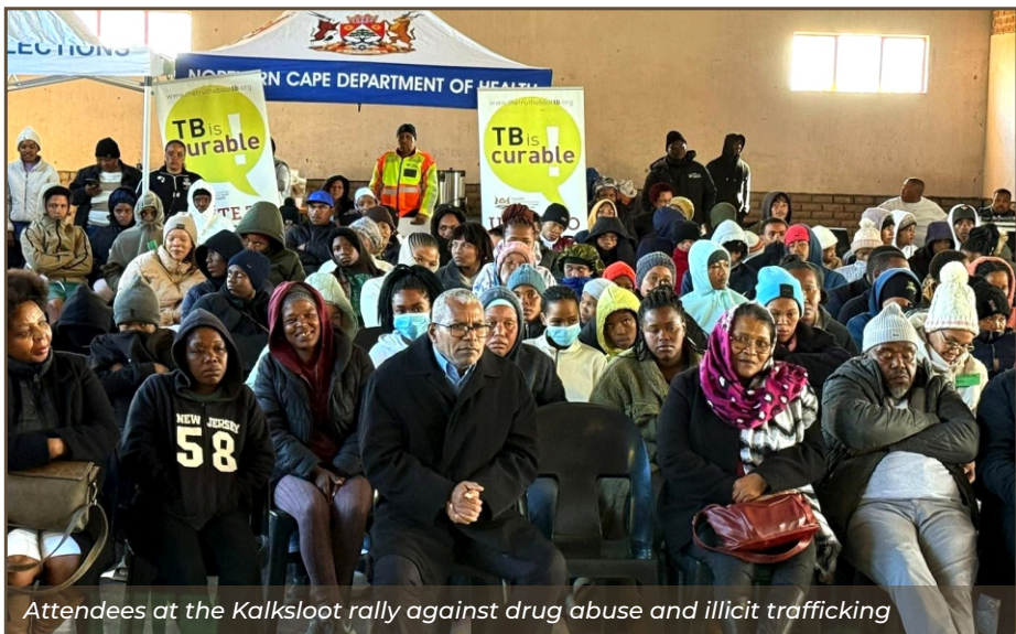
Attendees at the Kalksloot rally against drug abuse and illicit trafficking

Youth empowerment, trauma-informed care, and inter-departmental collaboration were central themes. Community voices, including SAPS and a rehabilitated ex-offender, called for action and healing. This initiative aligns with the 7th Administration’s ongoing commitment to integrated service delivery and social renewal, reminding young people: “You have the power to resist and rise.”