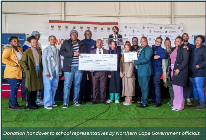
Donation handover to school representatives by Northern Cape Government officials.