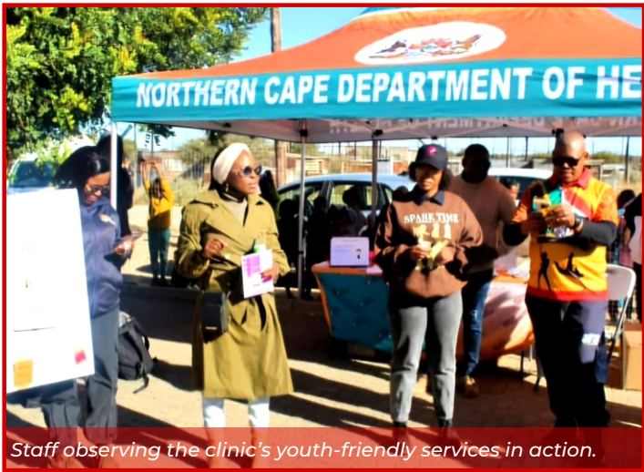
Staff observing the clinic's youth-friendly services in action.