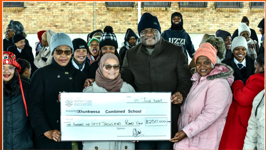
Premier Saul hands over R250 000 cheque to Xunkwesa Combined School in Platfontein

As a gesture of appreciation, he committed to a once-off donation of R4,000 to each of the 21 ECD practitioners to support their important work.