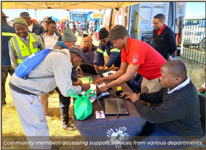
Community members accessing support services from various departments.