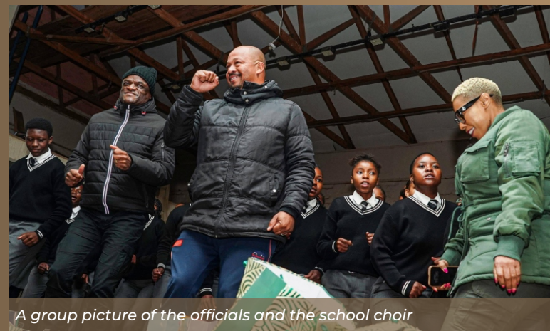
A group picture of the officials and the school choir