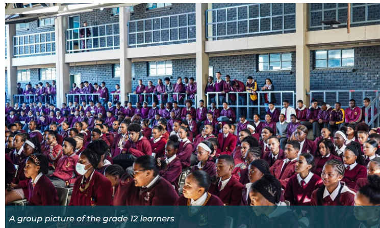
A group picture of the grade 12 learners