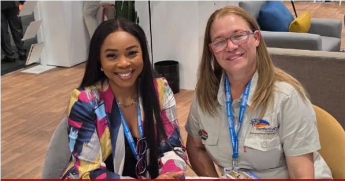
Product owners fully present at the Africa's Travel Indaba 2026.

The aim of this celebration is to reshape and diversify this kind of exercise for future descendants, while still maintaining Africa's tourism economy through inclusiveness and vibrancy.