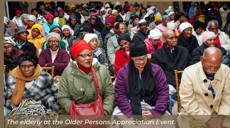
The elderly at the Older Persons Appreciation Event.