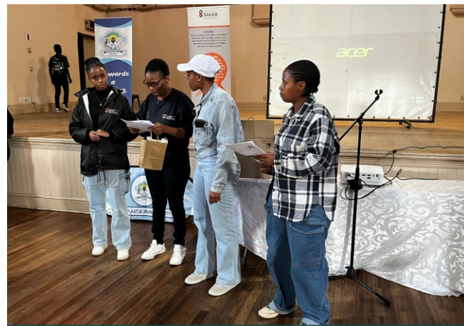
ORC deputy director with the Junior Council Speaker, Mayor and Chief Whip