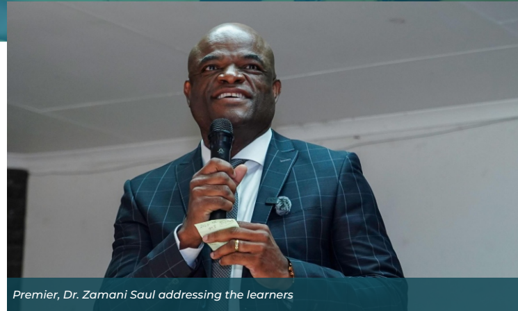
Premier, Dr. Zamani Saul addressing the learners

During his visit, Premier Dr. Zamani Saul handed over calculators to 273 learners and six educators at Saul Damon High School. The school also received R200,000 towards its Grade 12 intervention programme, a dedicated investment to support its learners. The distribution of calculators will continue across districts, ensuring that every Grade 12 learner in the province has access to the tools they need to achieve their full potential.