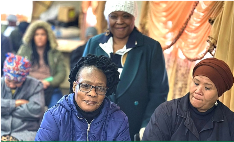
Community members attending the Comprehensive Agricultural Support Programme