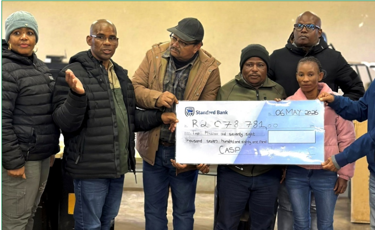
MEC Motlhaping with Comprehensive Agricultural Support Programme (CASP) beneficiaries

As part of the Department's support to the sector, MEC Motlhaping handed over R2 078 100.00 (Two million and seventy-eight thousand one hundred rand) to Comprehensive Agricultural Support Programme (CASP) beneficiaries, aimed at strengthening small-scale and emerging farmers by providing the resources needed for growth and sustainability. MEC Motlhaping also encouraged farmers to remain united, emphasizing that through collective action and strong partnerships, the sector can overcome its challenges, contribute to food security, and strengthen the local economy.