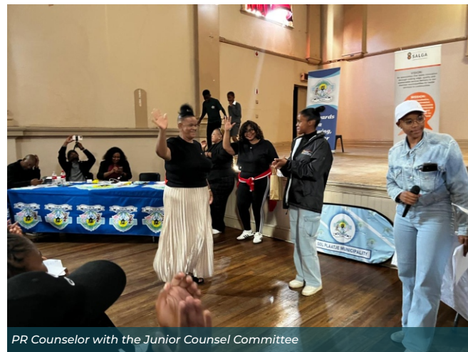
PR Counselor with the Junior Council Committee