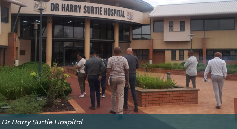
Dr Harry Surtie Hospital

A key innovation has been the deployment of a Mobile Application for Health Facility Monitoring, enabling unannounced inspections.