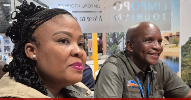
Delegates from NCEDA in attendance at the Africa's Travel Indaba 2026.