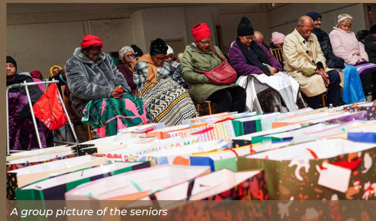
A group picture of the seniors

The Premier condemned elder abuse, exploitation and the unlawful confiscation of identity documents, calling for vigilance and unity. He stressed government's commitment to safeguarding the dignity, rights and well-being of older persons. The government has also intensified efforts to combat elder abuse and promote active ageing and social inclusion through accessible community programmes.