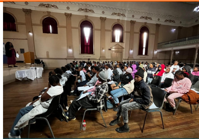
Junior Council Members induction at the Kimberley City Hall

The programme aims to foster accountability, service and leadership among young people, inspiring them to become active citizens and future leaders in their communities.