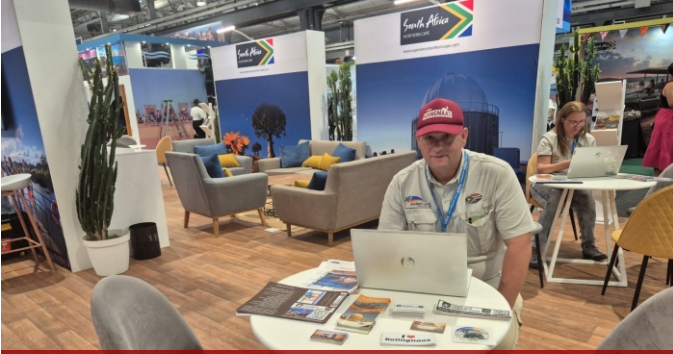
Africa's Travel Indaba 2026.